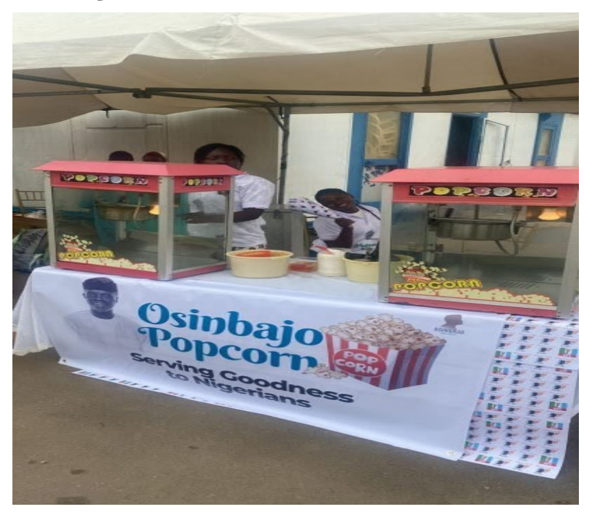
Meme 4 Osinbajo as a kind politician

indicates context-bound scripts in the Nigerian polity. Allegedly, Nigerian politicians are not naturally kind except when it deals with their interests. This is accentuated in a representative sample of memes with this frame thus: