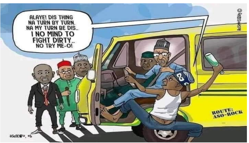
Meme 2 Tinubu as a thug