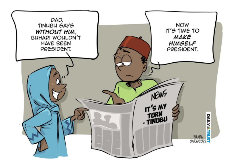
Meme 3 Tinubu as a kingmaker