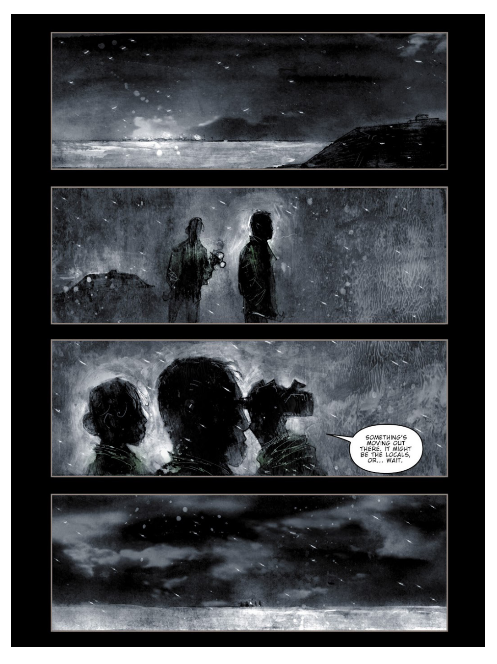
Figure 2 The Massacre Begins